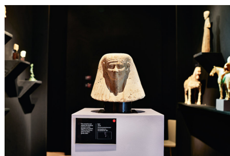
ArtAncient's 2015 stand

The LAPADA Art & Antiques Fair returns for its eighth year to the suitably breathtaking surrounds of Berkeley Square, Mayfair. Sponsored by Delancey, the LAPADA Fair offers an unmissable opportunity to source and buy some of the world's most coveted works of art, antiques, design and decorative arts. This year, it will take place from Tuesday 13 th September until Sunday 18 th September 2016, marking the start of London's fashionable Autumn art season.