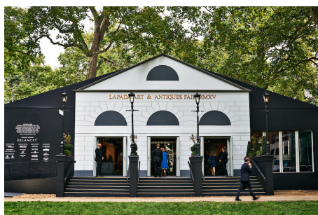
LAPADA Art & Antiques Fair 2015