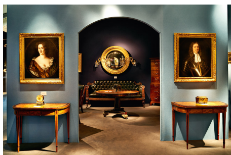
Freshfords Fine Antiques' 2015 stand

SAVE THE DATE LAPADA Art & Antiques Fair The Most Prestigious Art and Antiques Event of the Year 13 th – 18 th September 2016